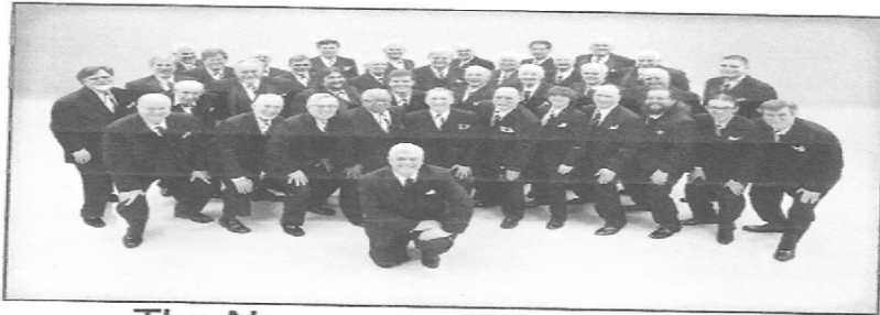
The Narragansett Bay Chorus 15 Time Barbershop Harmony Society Northeastern District Chorus Champions in an a capella concert with