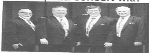
Mansion Vocal Band Barbershop Harmony Society Northeastern District Senior Quartet Champions