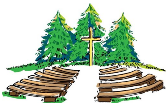
Chapel in the Pines

Mark your calendars and bring your family. Rally Day is not just about learning; it's a celebration of our community, our faith, and our shared purpose. Let's embark on this journey together, discovering all the ways we can grow and support one another. We can't wait to see you there!