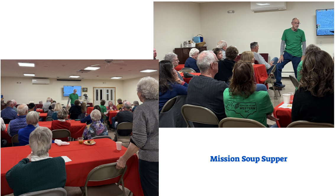
Mission Soup Supper

The WARM Shelter asks that if anyone sees someone who appears to be homeless, they call the mobile Street Outreach Case Manager directly at 401-932-5019 , or the WARM Center at 401-596-9276 .